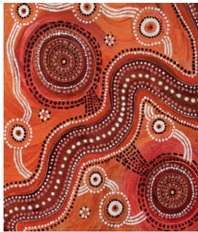
GLOBAL OVERVIEW: INDIGENOUS SUICIDE RATES